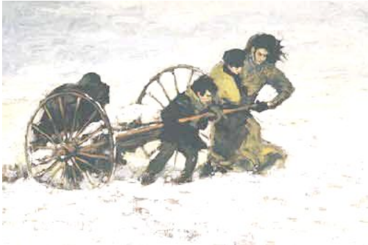
Salt Lake, pulling carts behind them.

People didn't like these „Latter Day Saints“. Smith and his followers moved to Ohio, then to Missouri, and finally to Illinois. There, in 1844, Smith was murdered by a mob.